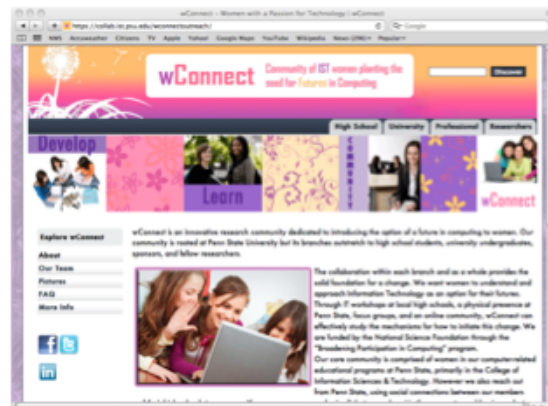
Public website publicizes project vision and activities and recruits new members